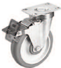
SS POSI-LOC BRAKE PB/SS