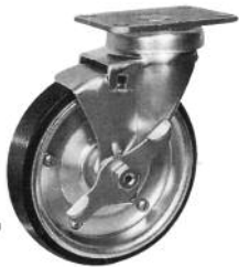
SS VERTILOK BRAKE VB/SS